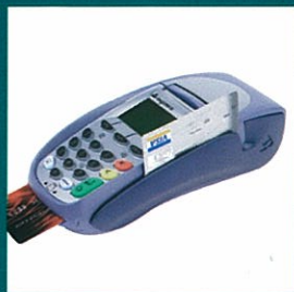
Optimal and secure card reading