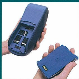
Long life battery Up to 200 transactions Fast charge