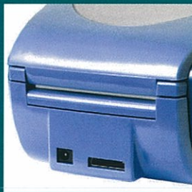
Ergonomic and simple connectivity