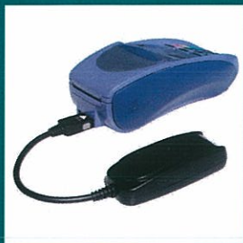
Backup external modem (LinkBox)